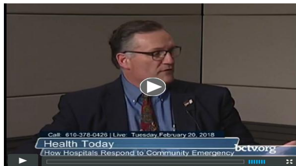
Health Today 2-20-18